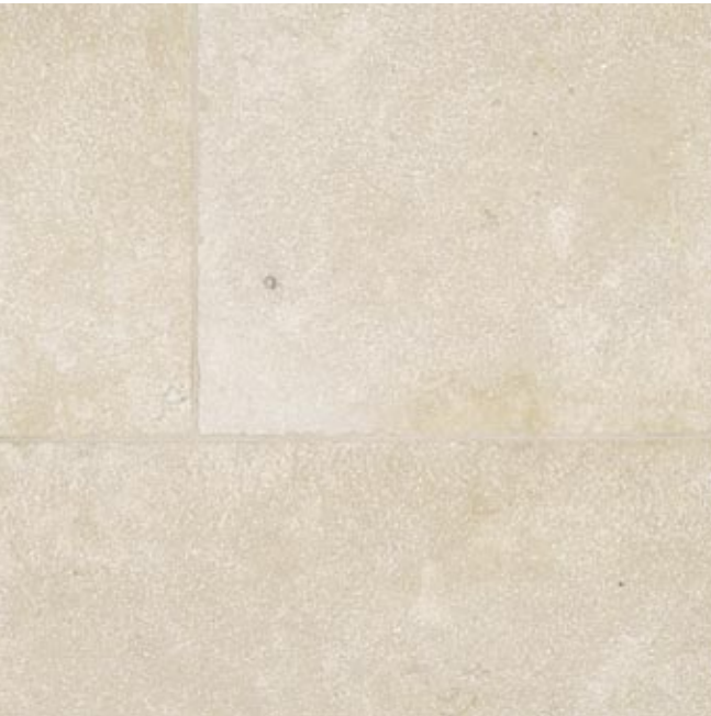
Dalle de Basque RE-DB-34