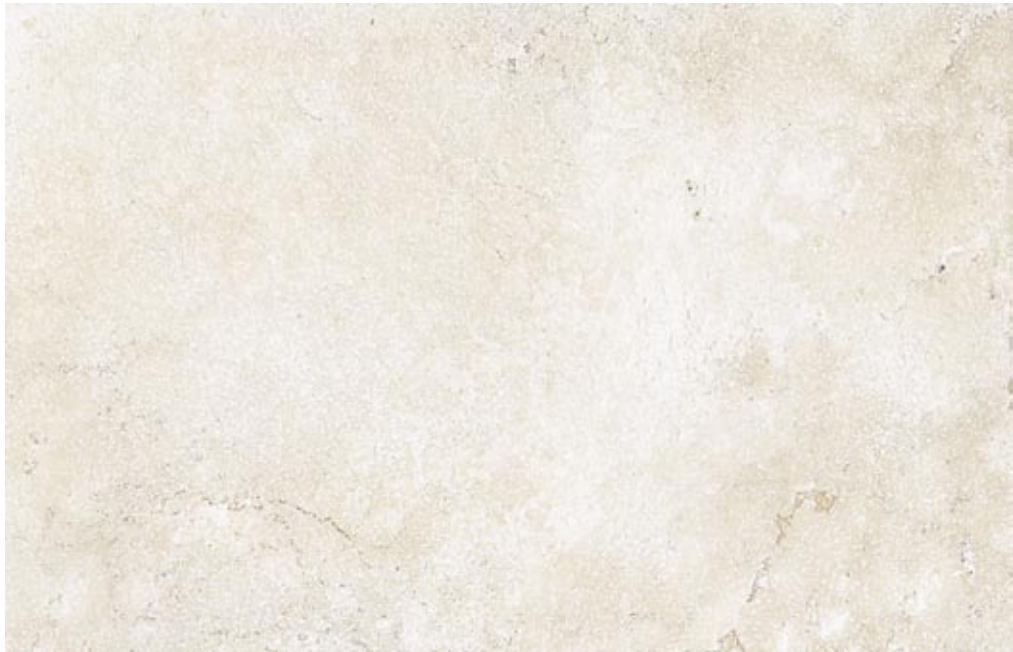
18" X 28" RE-PL-1828-34

singles, approximately 3/4" thickness, stone displayed below is Pierre de Lorraine