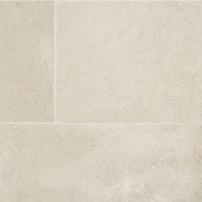
Re-Edition Bourgogne RE-RBN-34