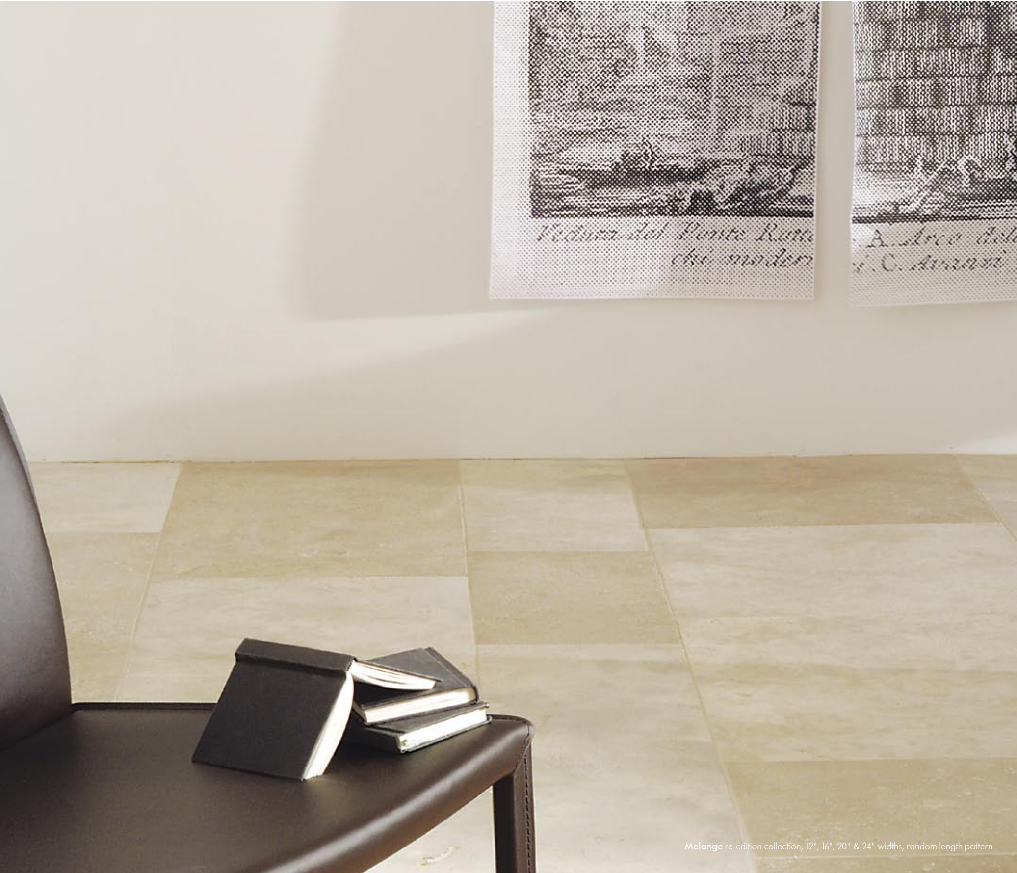
Melange re-edition collection, 12", 16", 20" & 24" widths, random length pattern