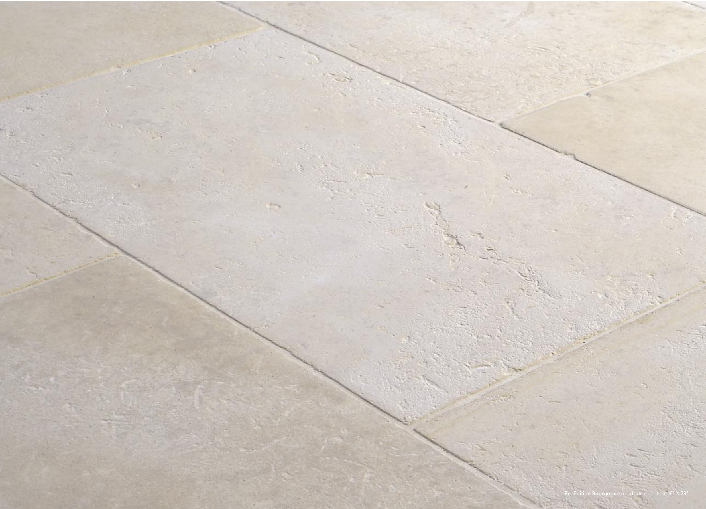
Re-Edition Bourgogne re-edition collection, 18" X 28"