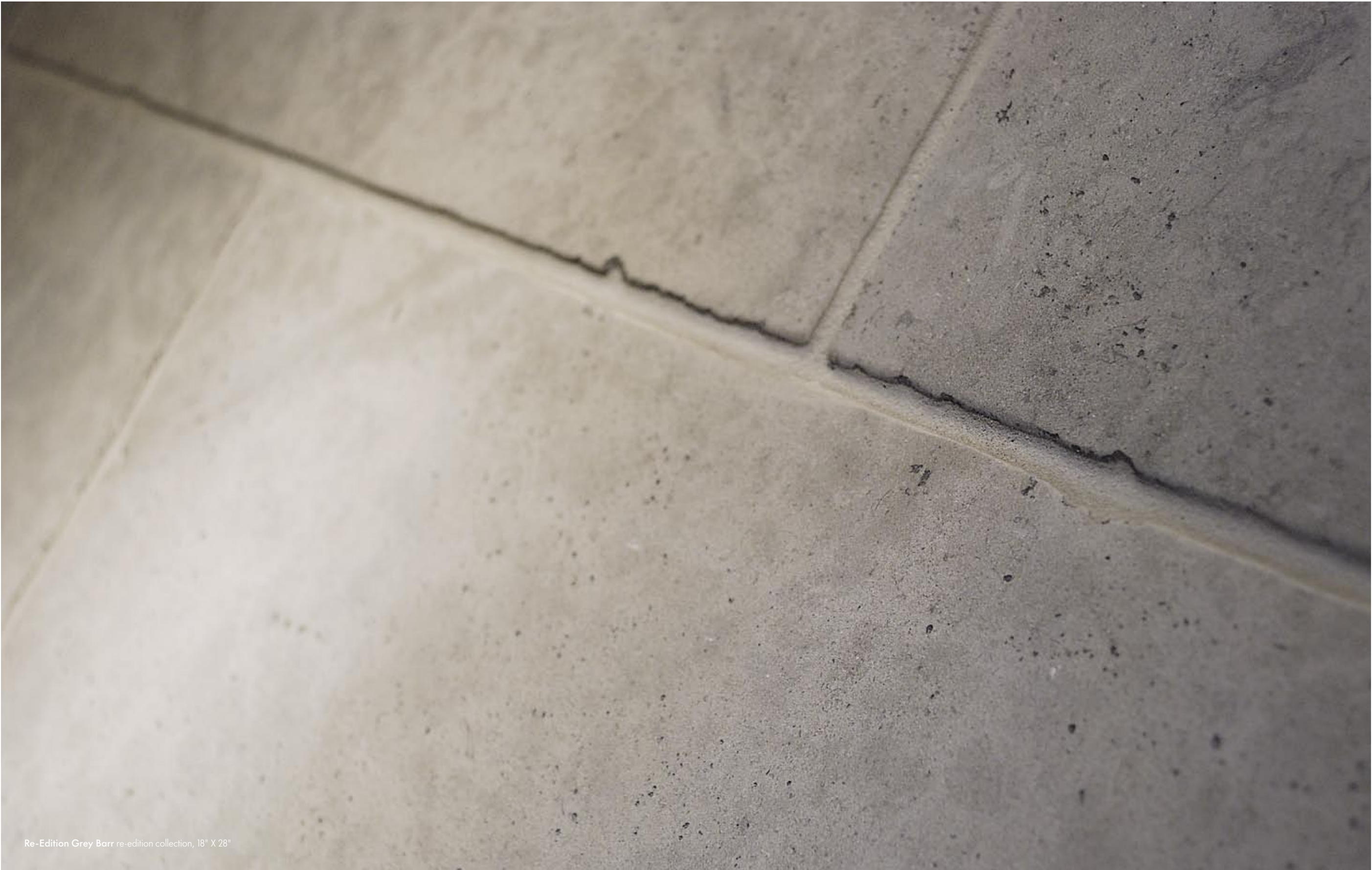
Re-Edition Grey Barr re-edition collection, 18" X 28"