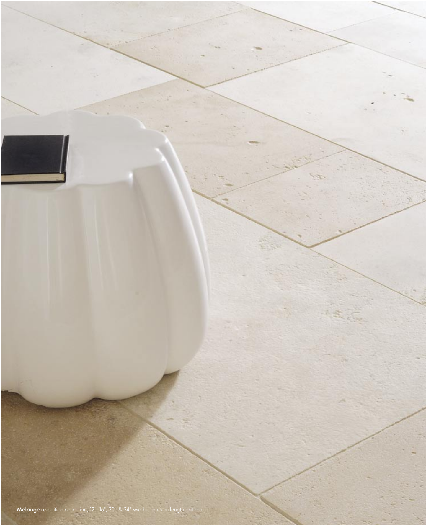
Melange re-edition collection, 12", 16", 20" & 24" widths, random length pattern