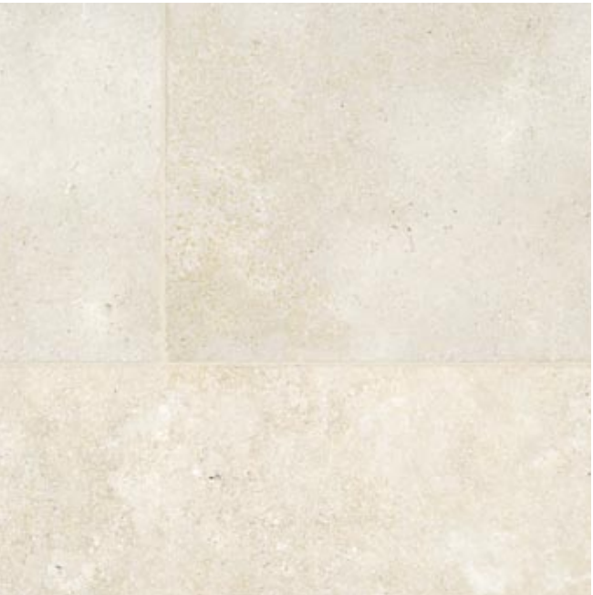
Pierre de Lorraine RE-PL-34