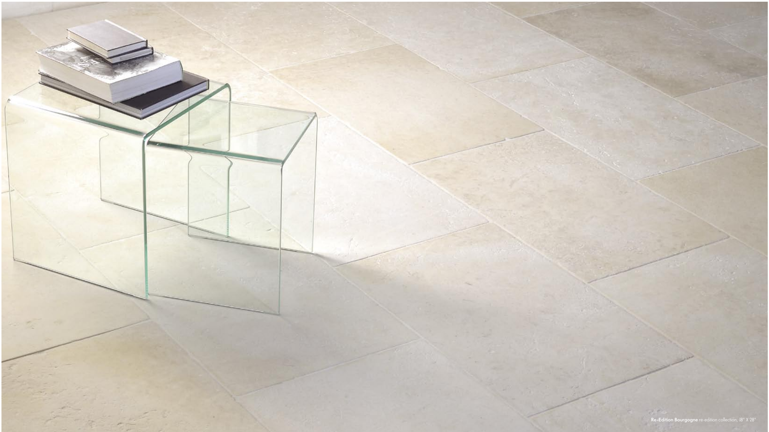
Re-Edition Bourgogne re-edition collection, 18" X 28"