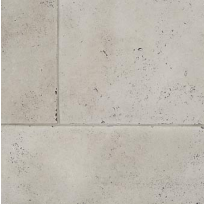
Re-Edition Grey Barr RE-RGB-34