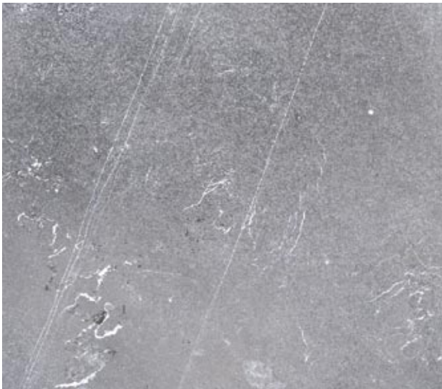
Negro chateau finish NE-CH