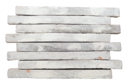
Mottled Light Grey